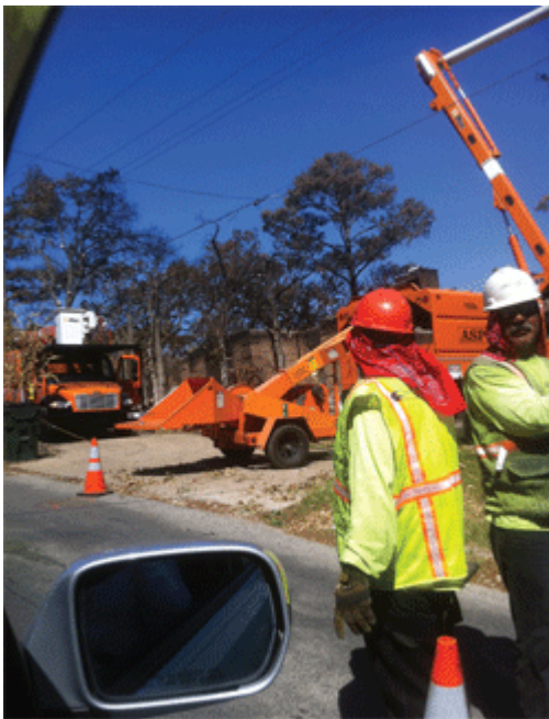
Tree trimmers cut branches away from power lines in an effort to prevent more wildfires in the Bastrop, Texas, area.