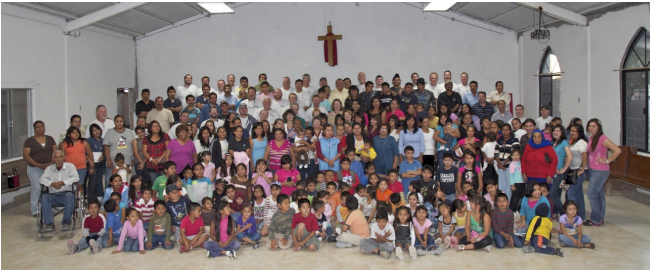
Top of picture: Men's team from Asbury, Tulsa, Oklahoma. Three rows below from top: Medical team from Shreveport, Louisiana. Congregation of El Camino Church.

On our latest news, we praise God for the dedication of El Camino Methodist Church in Reynosa last November 19 th , where many construction teams worked in the new 40' x 85' building plus 5 classrooms and restrooms along with other Conferences teams and many medical teams will continue to do free one day clinics.