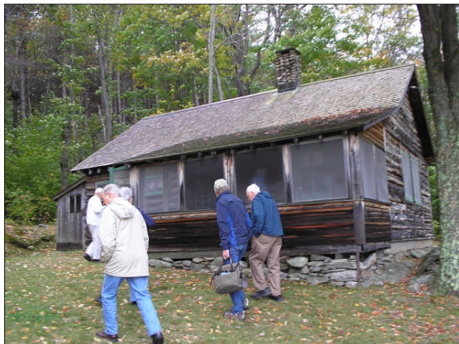
Entering Robert Frost’s cabin in the Vermont woods.

The PTs enjoyed the private visit inside the cabin of Robert Frost, Ben and Jerry’s ice-cream factory, Rokeby Museum and its Underground Railroad, worshipping at Shelburne UMC, the Lake Champlain cruise, the sample table at Cabot Cheese Factory, the picnic on top of Mt. Philo, Vermont’s incredible views, the Vermont State House tour, participating in Bill McKibben’s 350.org grassroots movement to solve the climate crisis, the Middlebury College