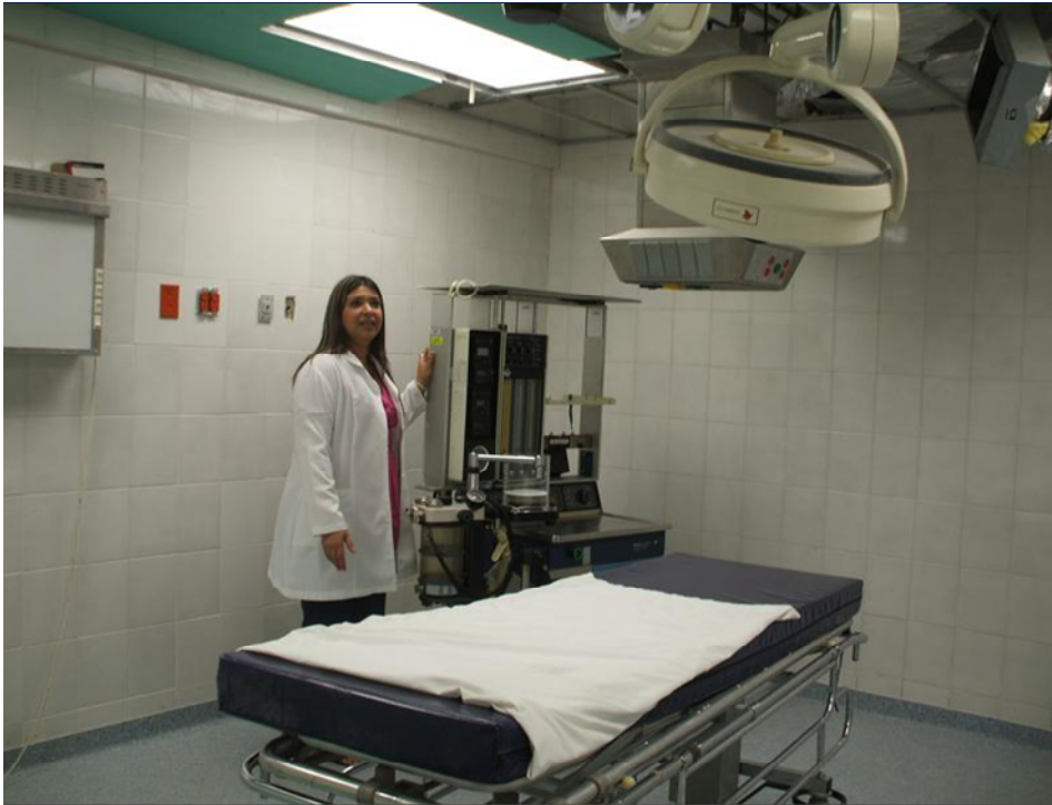
Betania Methodist Hospital surgery room in Reynosa.

Again, we would like to say that the issue of safety in Mexico has been blown out of proportion by the media. Those of us who live here and worship, work, play and have sons, daughters and loved ones that carry on their lives as we have done always are surprised at the amount of fear a misguided report can have. Bear in mind that mission teams come to serve the Lord, not to get involved in illicit or dangerous "tourist" endeavors, and have the guidance and protection from Him and the knowledge and expertise of the Methodist Church of Mexico through our Manos Juntas/VIM Mexico ministry. This does not mean we can absolutely guarantee that no random occurrence may happen; nobody can give you that kind of assurance anywhere in the world, but that we do know how to minimize that possibility.